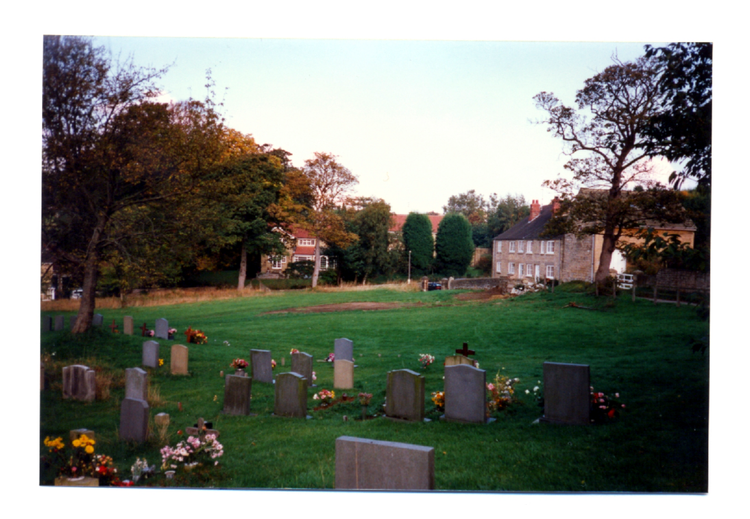
Churchyard, east and, October 96